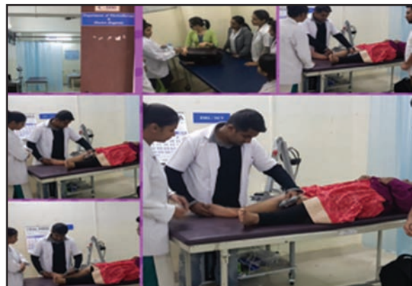
Electro Diagnosis Lab