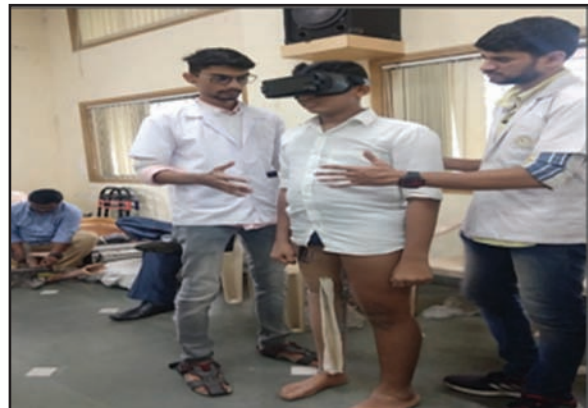
Post- Amputee Rehabilitation