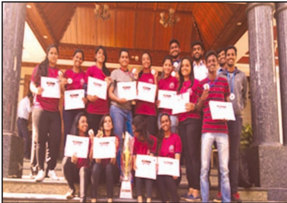
Intercollegiate Sports Competition