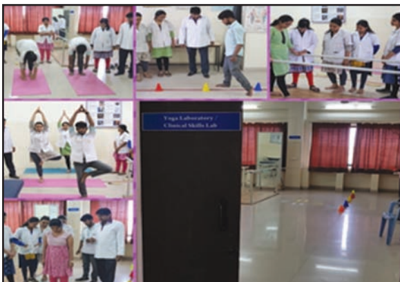
Yoga & Clinical Skill Lab