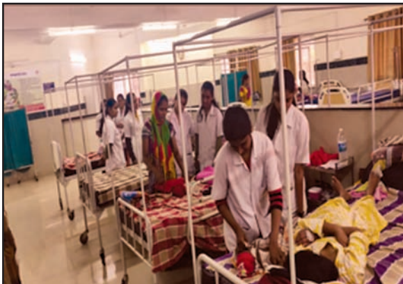
ANC – PNC Rehabilitation